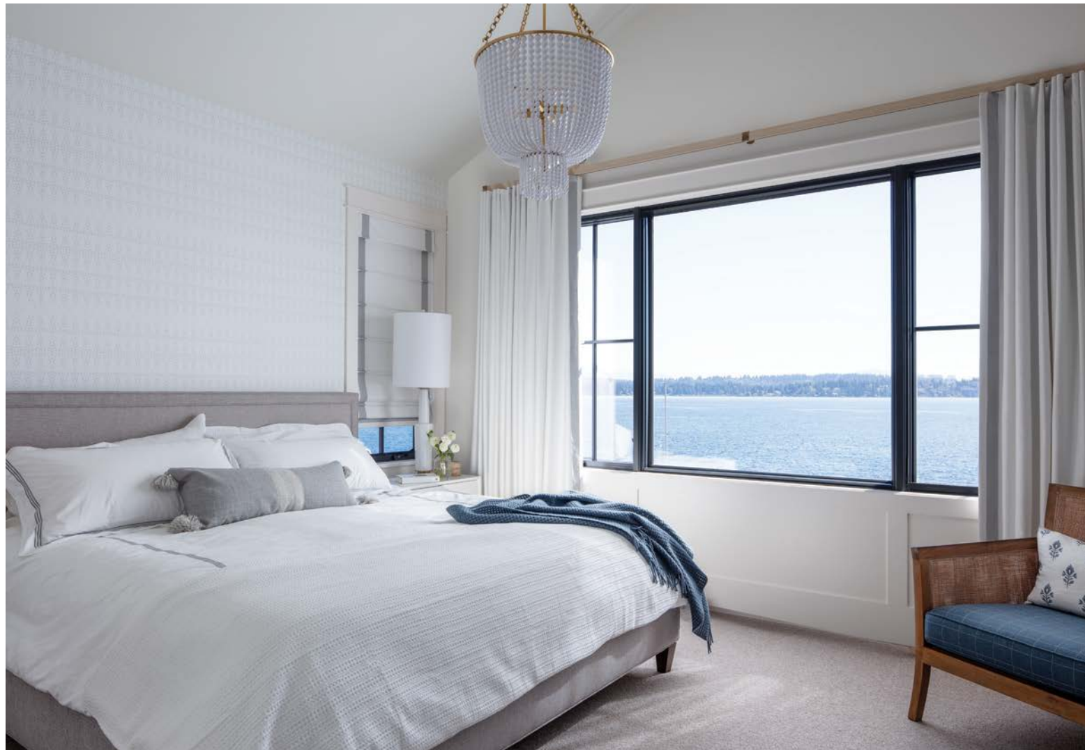
RIGHT+BOTTOM The main bathroom is now wrapped in 3x6 Calacatta marble tile by Ann Sacks, in a wainscot behind the Signature Hardware tub and vanity, and in the walk-in shower. The overhead and sconce lighting is by Visual Comfort. Stroud designed the vanity with Waterworks hardware. TOP The main bedroom is softened with custom window coverings, including curtains composed of Pindler & Pindler linen fabric, and a shade with Schumacher trim from The Dixon Group.